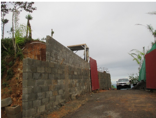
Entrance to Vista Alta