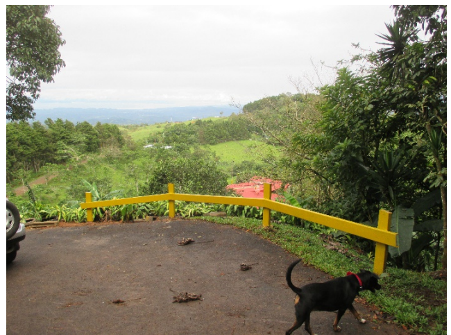
New Guardrails in place VA