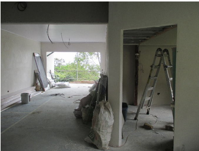
Buganvilla, Available 17 August

New Apartments, Vientos Bajos. We're making great progress on the remaining two apartments in Vientos Bajos. The current inventory is Buganvilla, a two-bedroom/one bathroom apartment, which rents for $1,000/month, and Amapola, a two bedroom/two bathroom which, fully furnished, rents for $1,100/month. A minimum six-month lease is required.