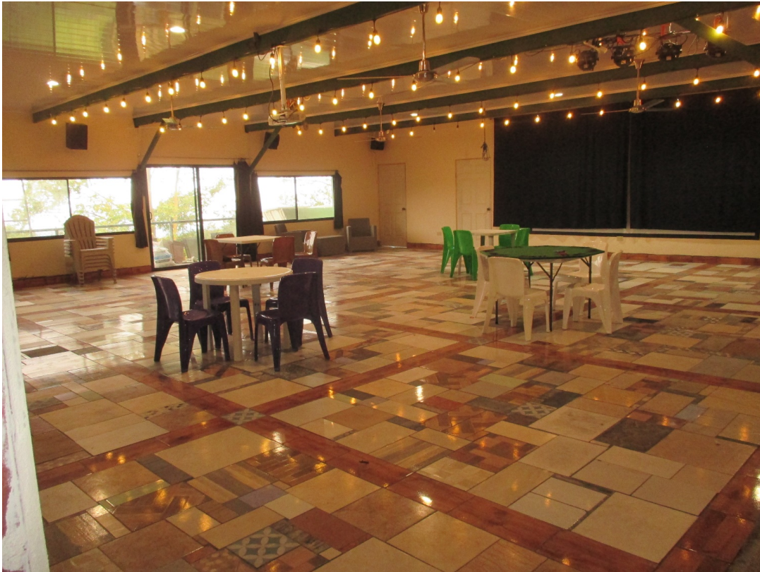
New Mosaic Floor added to Recreation Room, Vientos Bajos

New Website: We've updated our website. Please take a look at www.jardinlаторre.com and let us know what you think!