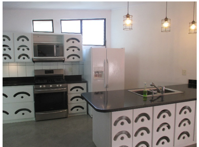
Amapola Now Available