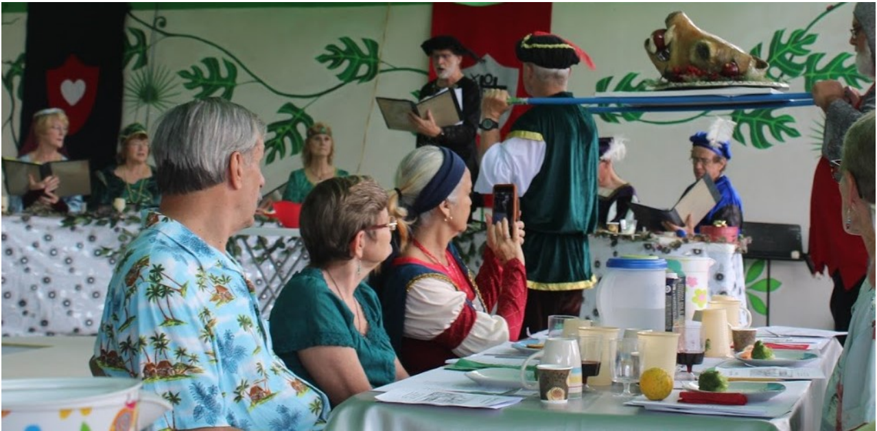
Presentation of the Boar's Head, 2020

Opening with our twelfth consecutive TubaChristmas at 11:15 AM, we will follow at 12 noon with our tenth annual madrigal dinner on Saturday and Sunday, 11 and 12 December. The madrigal dinner will be a full-course meal, headlined with Las Tinajitas' famous smoked pork steak. A vegan or special meal is available with advance notice. The San Ramon public music school, SiNEM, is having their annual party on Saturday, but four of their musicians will be joining our TubaChristmas on Sunday.