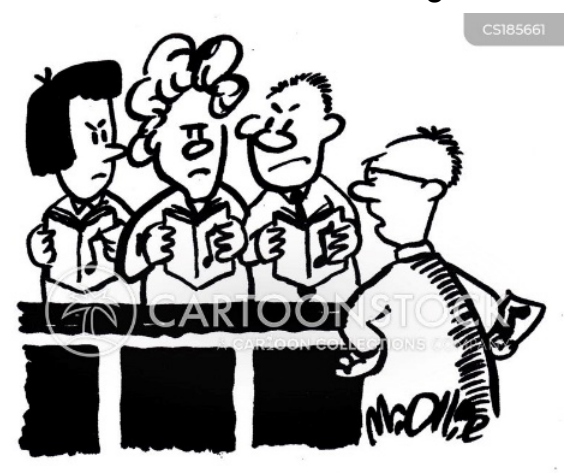
"No, this is the choir, NOT your backup group!"

v. Mixed Chorus (NEW), TH, 1:30 PM. With most having received their second vaccination, we've had requests for and are willing to try to re-start mixed chorus. If we get enough interest, I'll do everything I can to find an accompanist and we can begin from there. I think we're going to need at least six singers to make this work. There will no doubt be a fee in order to pay the accompanist, but we'll keep this as low as we can—and of course, the more singers, the smaller the contribution per singer. If you're interested, PLEASE contact us so we can start a roster. Also, if Thursday afternoon doesn't work and you're interested, please let us know what does work for you and we'll see if we can arrange a different day and time.