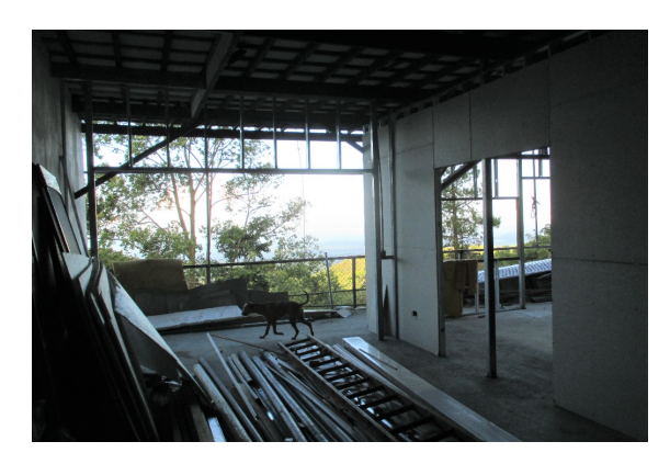
Buganvilla —two bedrooms, one bathroom

b. Final Apartment, Buganvilla. As we move into the rainy season, our primary goal is to seal the remaining apartment against the incoming rain. By the end of this month, we hope to have Buganvilla totally enclosed.