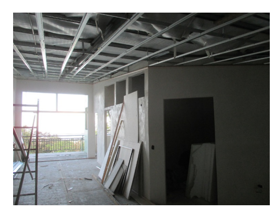
Heliconia—Two bedrooms, one bathroom

b. Final Apartment, Buganvilla. As we move into the rainy season, our primary goal is to seal the remaining apartment against the incoming rain. By the end of this month, we hope to have Buganvilla totally enclosed.