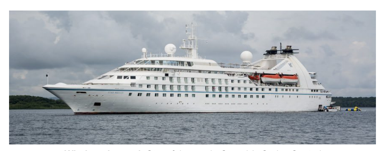
Windstar Legend: Star of the movie Speed 2: Cruise Control

Need a break? We've been working with Windstar Cruise Line to put together a cruise package for those of you who want to try something a little different. Several things drew us to this line and this cruise. First of all, it departs and returns to Puerto Caldera, only an hour's drive from San Ramón—no expensive, long flights to get to or from the port. Second, this is a great cruise line offering first-class service. Caryl and I cruised with them in JAN 2020 and were impressed with their small ship experience. Third, it stops at a different port each day, giving us an opportunity to walk around and explore. And lastly, it's an opportunity to share some time with people you know and like—and also to meet and enjoy people from outside the area. We're working through Tye Rogerson, an employee and direct representative of Windstar: <a href="mailto:tye.rogerson@windstarcruises.com">tye.rogerson@windstarcruises.com</a> In order to get the best deal, please mention Vientos Bajos . You can get more detail on the ship and the cruise on the Windstar web site, <a href="mailto:https://windstarcruises.com">https://windstarcruises.com</a>