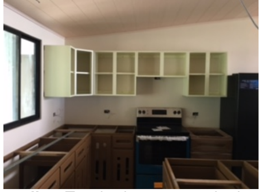
Bromelia—Two bedrooms, one bathroom