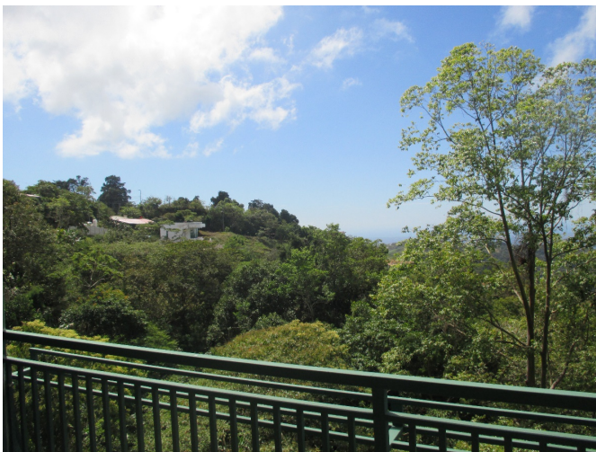
View from one of the VB apartments.