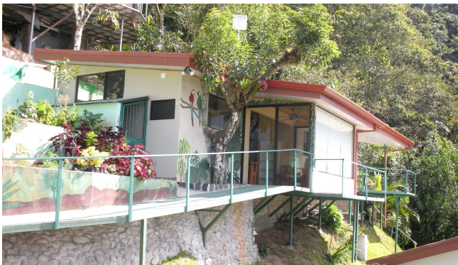
Loro House, one of the two-bedroom houses available for sale or rent at Jardin La Torre.