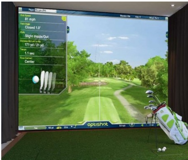
Golf Simulator (artist's conception)