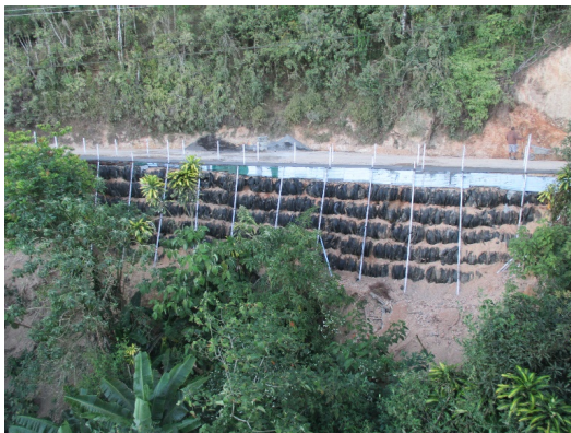
Road work completed at end of 2018.