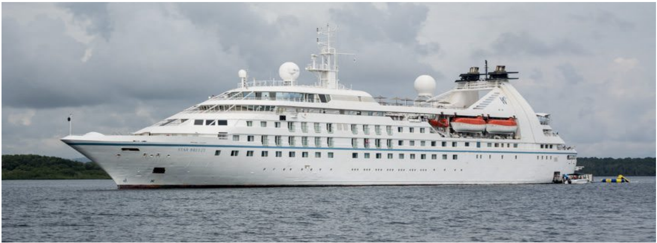
Windstar Legend: Star of the movie Speed 2: Cruise Control

Need a break? We've been working with Windstar Cruise Line to put together a cruise package for those of you who want to try something a little different. Several things drew us to this line and this cruise. First of all, it departs and returns to Puerto Caldera, only an hour's drive from San Ramón—no expensive, long flights to get to or from the port. Second, this is a great cruise line offering first-class service. Caryl and I cruised with them in JAN 2020 and were impressed with their small ship experience. Third, it stops at a different port each day, giving us an opportunity to walk around and explore. And lastly, it's an opportunity to share some time with people you know and like—and also to meet and enjoy people from outside the area. We're working through Tye Rogerson, tye.rogerson@windstarcruises.com an employee and direct representative of Windstar. In order to get the best deal, please mention Vientos Bajos . You can get more detail on the ship and the cruise on the Windstar web site, https://windstarcruises.com