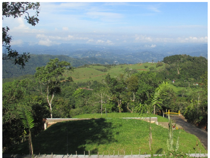
View as of 1 September, 2021