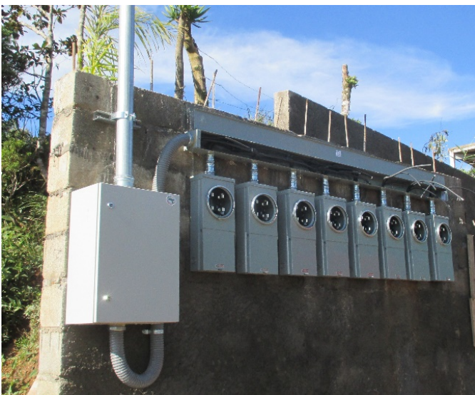
Common Meter plus seven lots

August saw the completion of electric meter installation for the subdivision.