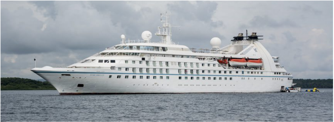
Windstar Legend: Star of the movie Speed 2: Cruise Control