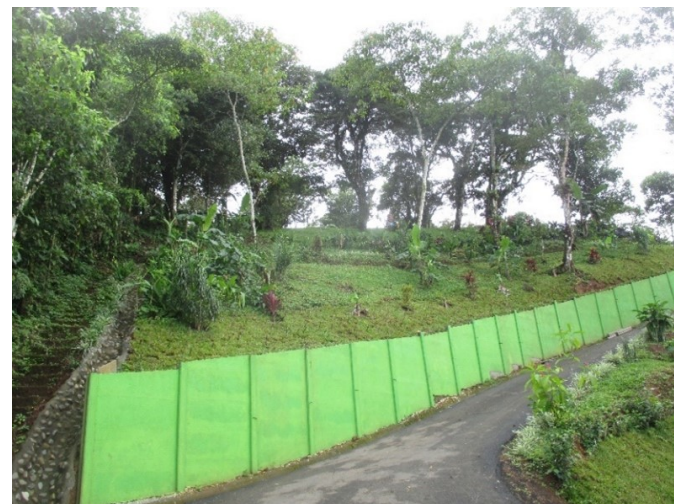
Left: One of the many garden paths, with new sod on left. Right: New retaining walls and LOTS of new sod.