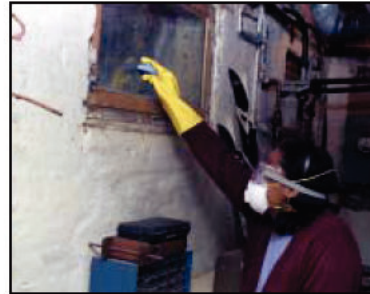
Cleaning while wearing N-95 respirator, gloves, and goggles.

■ Wear goggles. Goggles that do not have ventilation holes are recommended. Avoid getting mold or mold spores in your eyes.