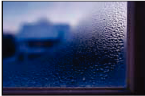
Condensation on the inside of a windowpane.

■ Keep indoor humidity low. If possible, keep indoor humidity below 60 percent (ideally between 30 and 50 percent) relative humidity. Relative humidity can be measured with a moisture or humidity meter, a small, inexpensive ($10-$50) instrument available at many hardware stores.