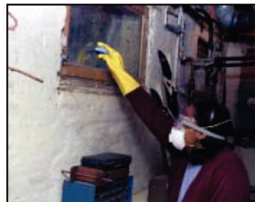
Cleaning while wearing N-95 respirator, gloves, and goggles.