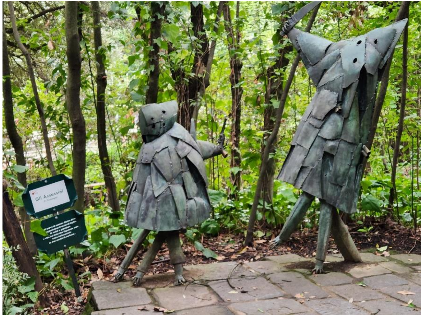
All photos c. 2019 FT