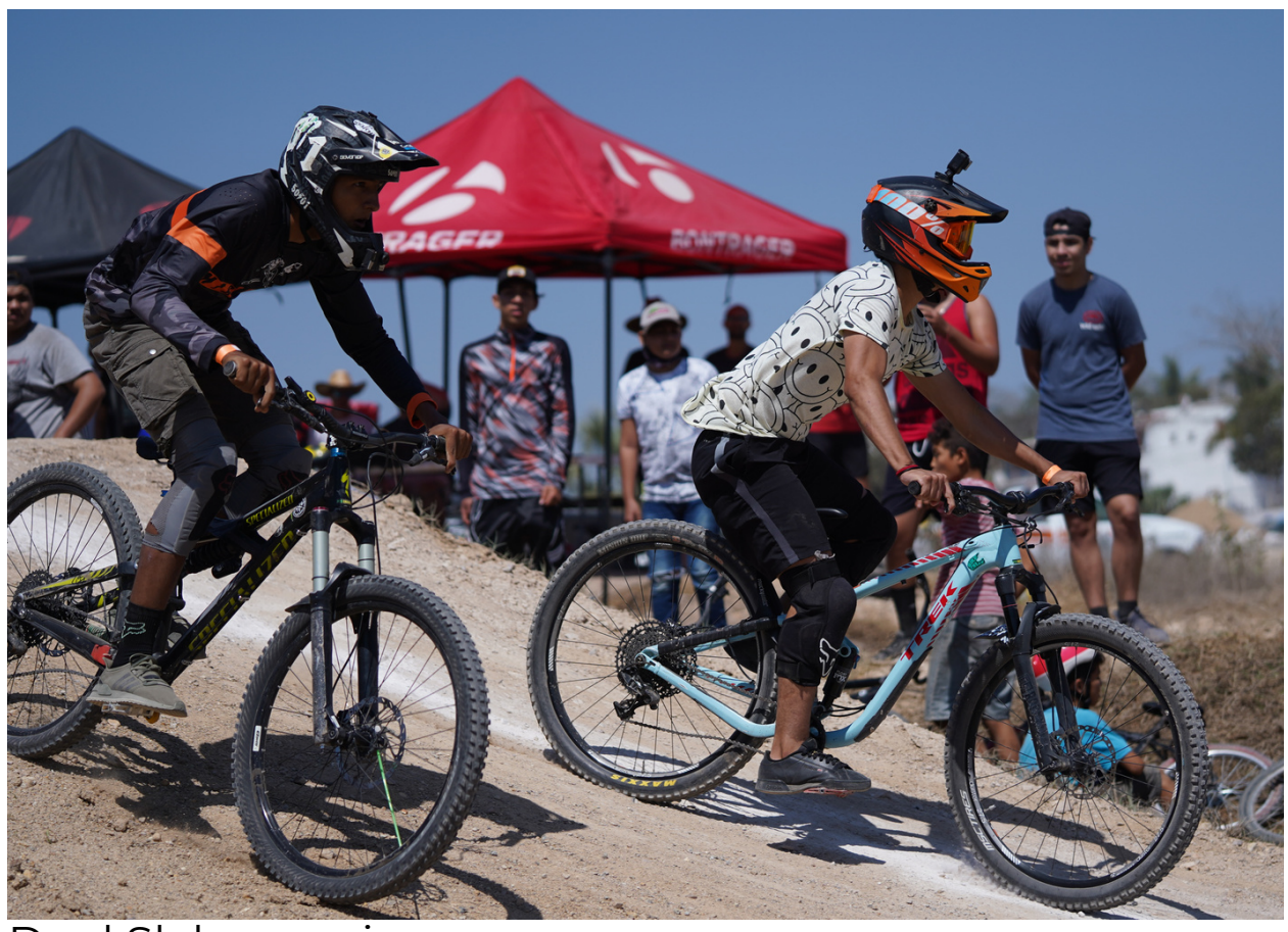
Dual Slalom racing