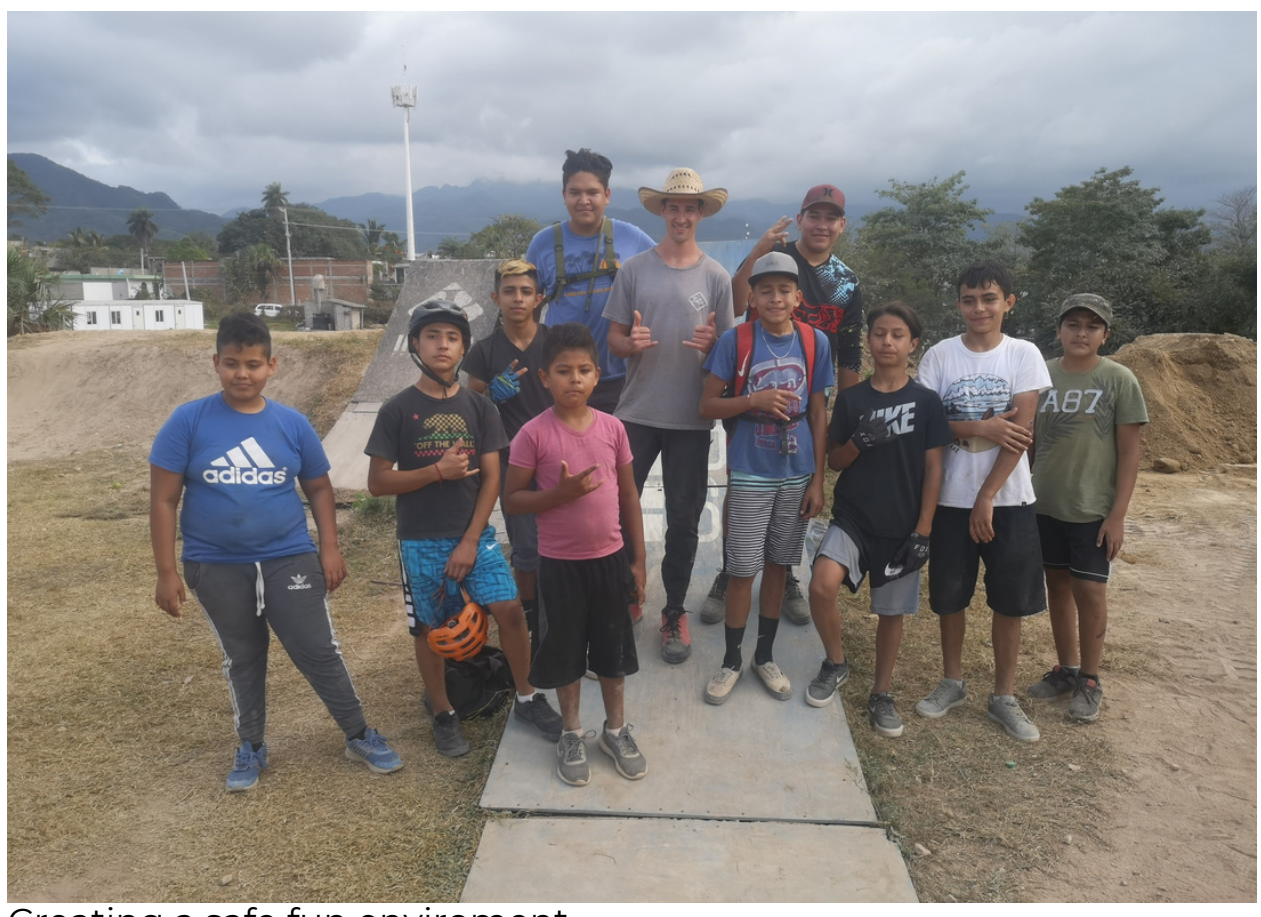
Creating a safe fun enviroment