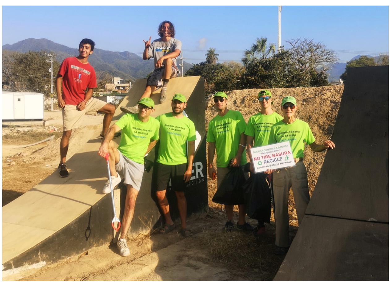
Cleaning project with the trash pickers volunteering group and promoting their message