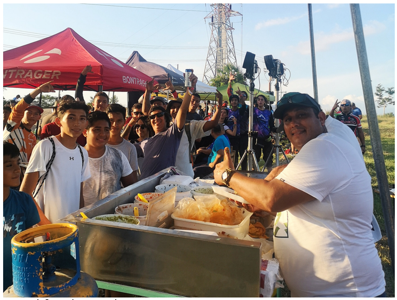
Local food stands