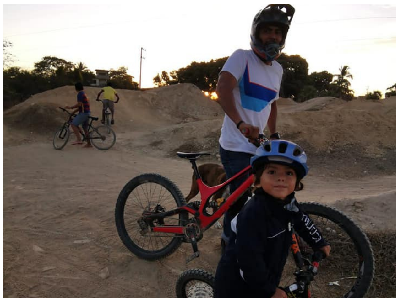
Bike park coahing