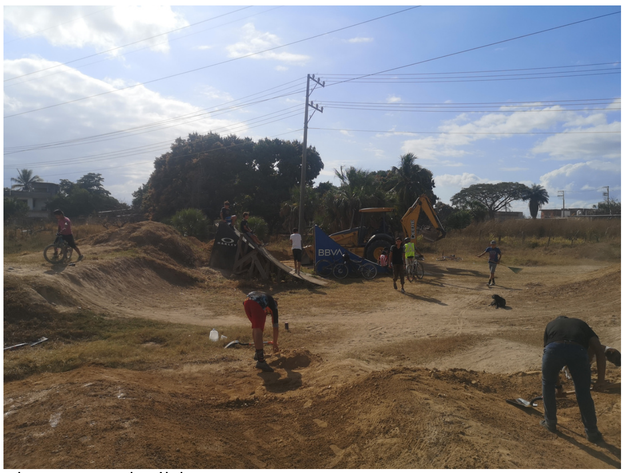
The course build