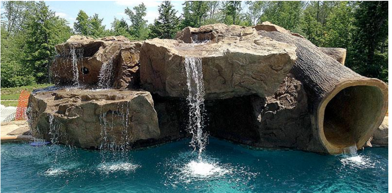
Tree Trunk Slide a signature enclosed water slide custom designed and built by ClifRock Installers using high performance concrete mix.