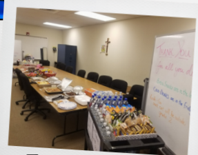
Teacher Conference Luncheon