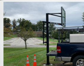
Basketball Hoops Installation