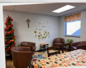
Teacher Lounge Decorations

Thank You to the School Staff and Parents that have given their time, input, and collaboration with PTO Officers on our monthly Virtual PTO meetings!