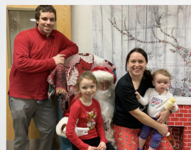
Breakfast with Santa