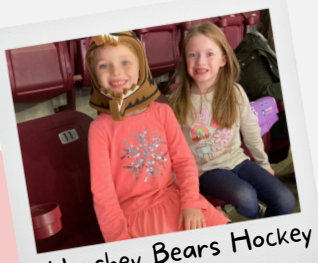
Hershey Bears Hockey Fundraiser