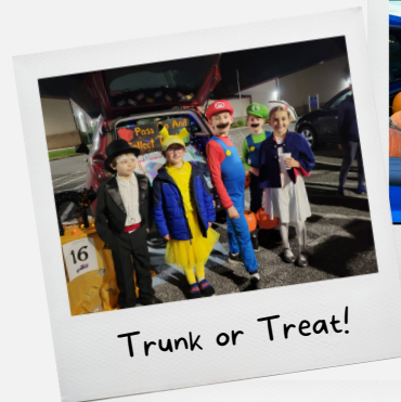
Trunk or Treat!