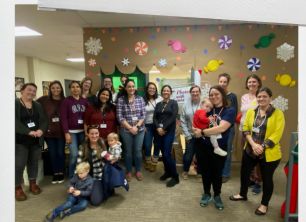
Some of Our Amazing Volunteers!