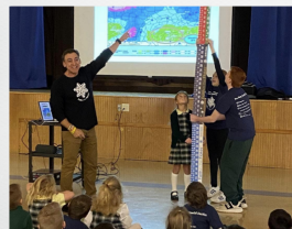
Faith in the Flakes Assembly