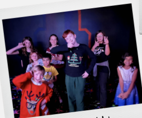
Laser Alleys Ugly Sweater Fundraiser