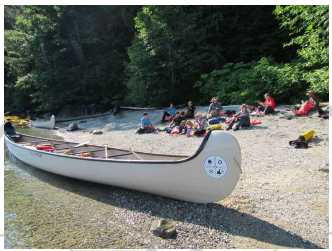
Lots of well deserved breaks along the journey.