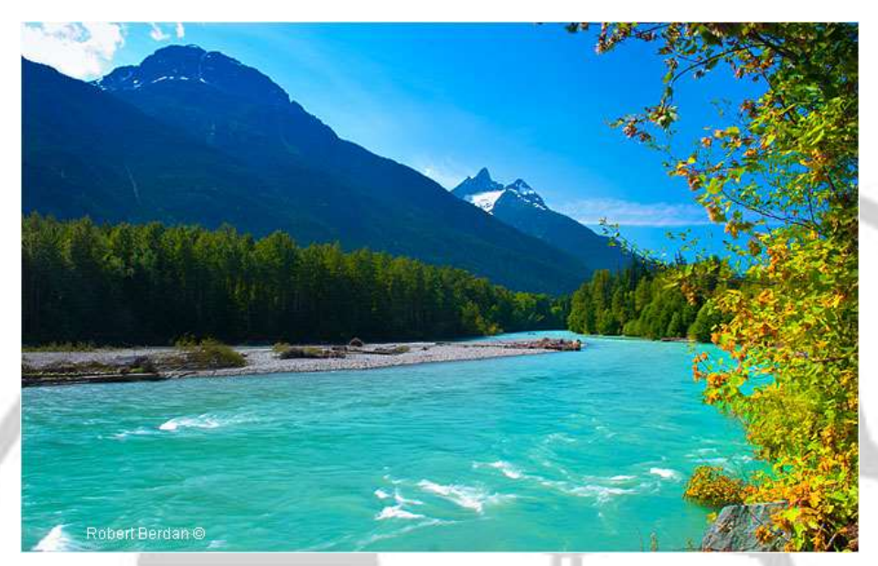
Bella Coola River