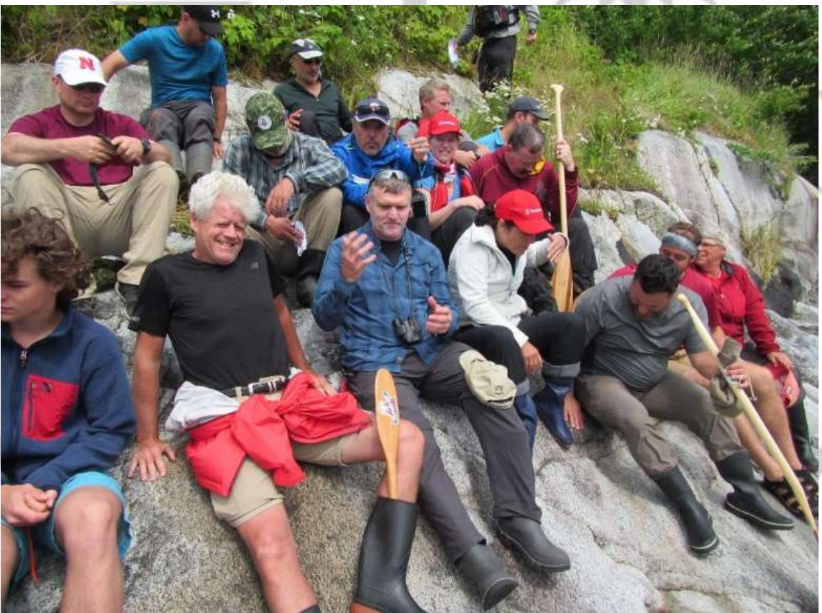
Once you reach our final destination – this is a great sense of accomplishment. Well done.