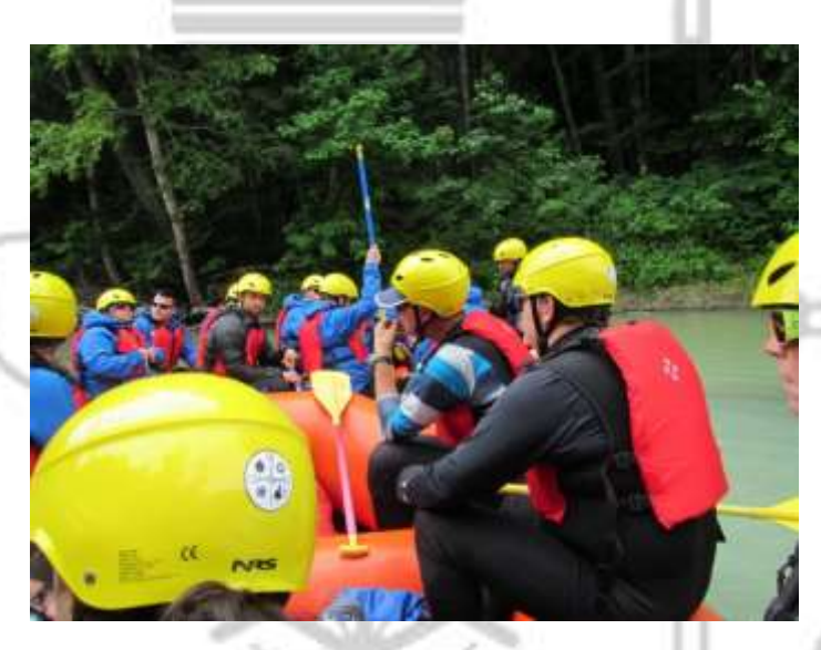
Safety and rafting talks