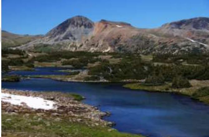
Pristine Lakes during our travels.