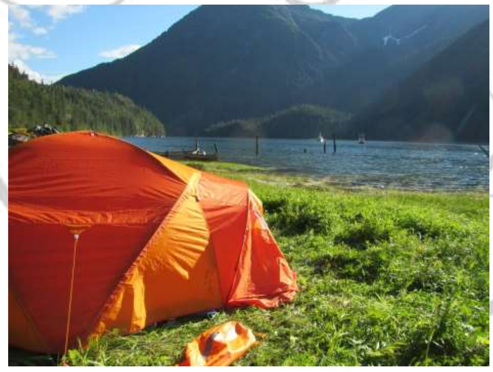
camping with spectacular views.