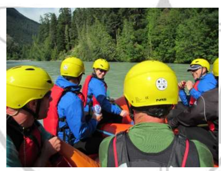
Lots of laughs along the way.

You will paddle the entire distance of the Bella Coola River in one day. This of course is going to be a spectacular trip with incredible scenery along the way. You will be accompanied in your raft with 6 other Mackenzie participants and your river guide. The drift down the Bella Coola River will be a welcome relief after the Mackenzie trail section of the expedition. During this component you will drift by a number of historical sites along the river, including the Nuxalk Nations number 1 reserve, finishing at the mouth of the Bella Coola River – the Bella Coola Estuary.