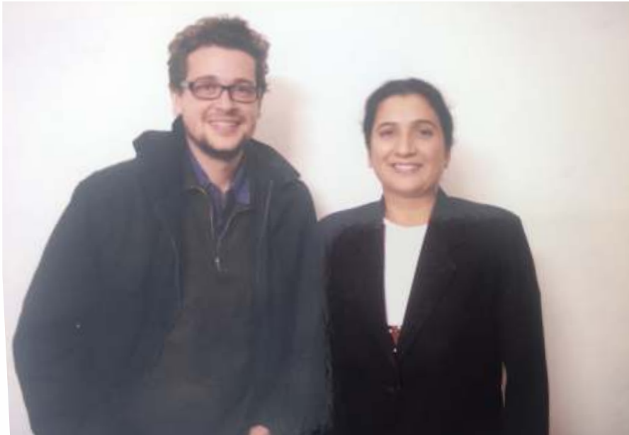
Journalist of 'Le-Monde', France