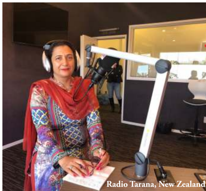
Radio Tarana, New Zealand