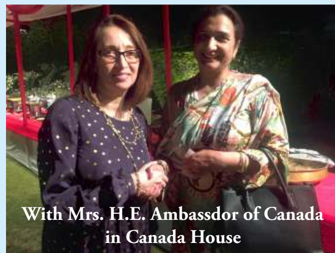
With Mrs. H.E. Ambassdor of Canada in Canada House