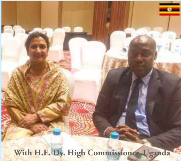
With H.E. Dy. High Commissioner, Uganda