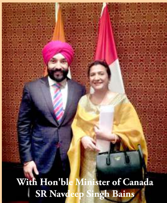
With Hon'ble Minister of Canada SR Navdeep Singh Bains