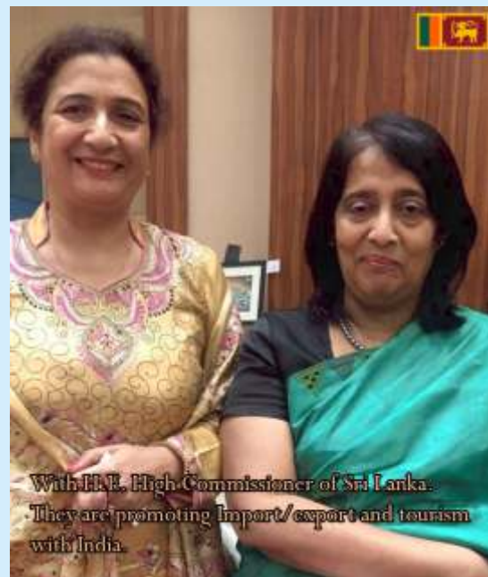
With H.E. High Commissioner of Sri Lanka. They are promoting Import/export and tourism with India.