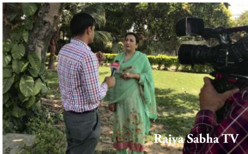
Rajya Sabha TV