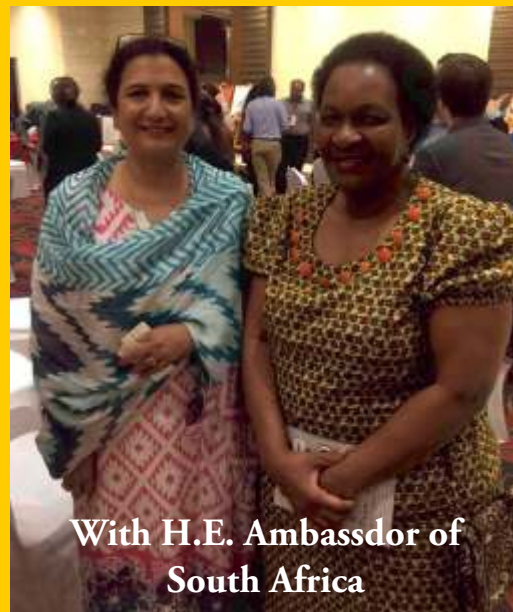
With H.E. Ambassdor of South Africa