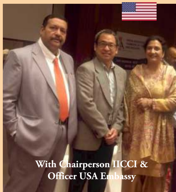
With Chairperson IICCI & Officer USA Embassy