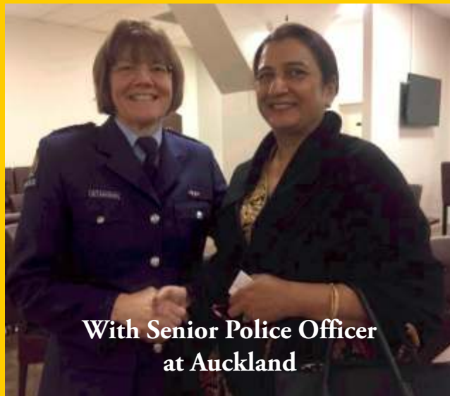
With Senior Police Officer at Auckland