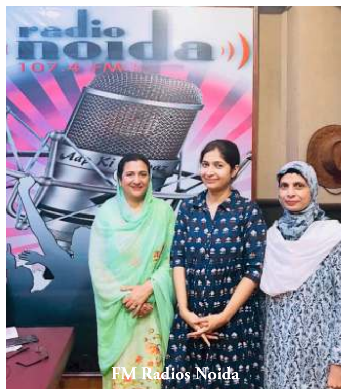
FM Radios Noida