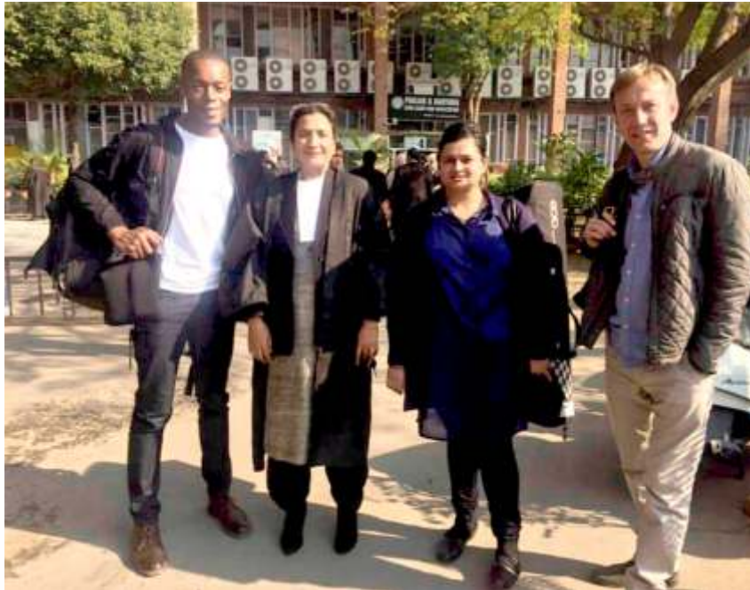
Team of BBC London on shoot of documentary on NRI Abandoned Brides