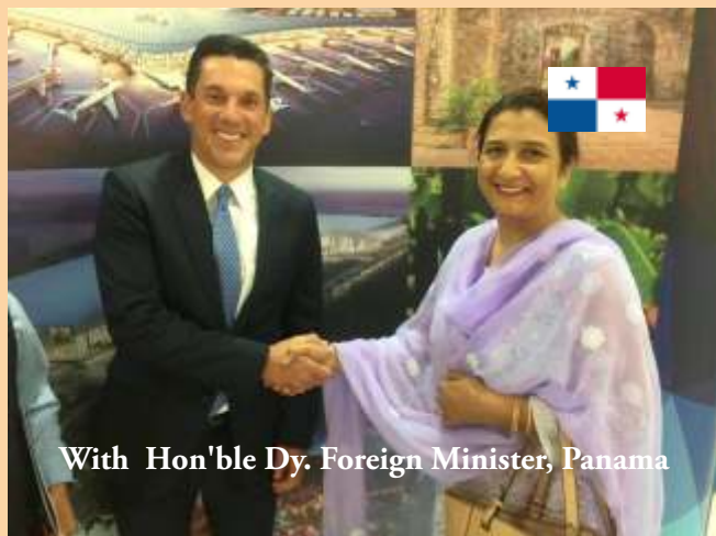
With Hon'ble Dy. Foreign Minister, Panama