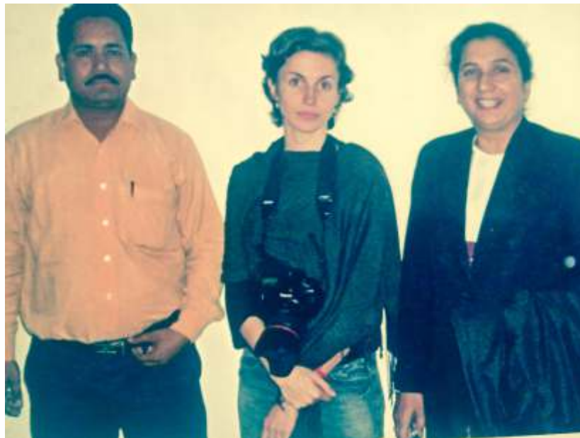
From Renowned Newspaper of France - Le Monde