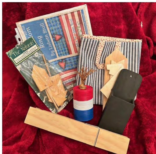
Stars and Stripes

Here is a sneak peak of the raffle bundles available at our July Paint in. I might be adding a few other items to some of them. Zoomers can also pre-order raffle tickets to get in on the action. Just Zelle me your money and text me which bundle you want your tickets in.