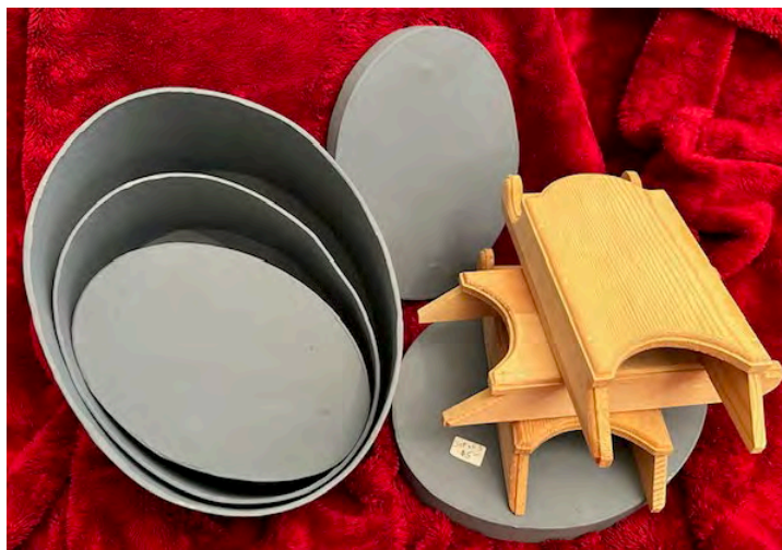
Sleds and Stacking Oval Paper Mache Boxes