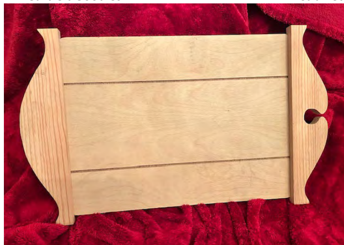
Vintage Plaque 24" x 14"