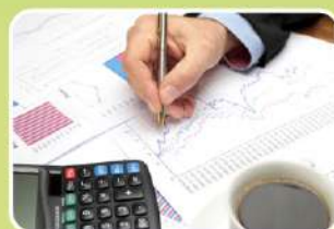
DPR and FUPs