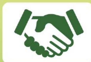
Branding & Marketing