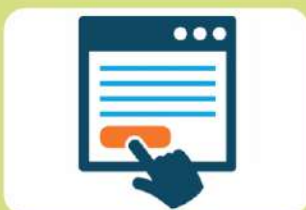
Application for the Subsidy