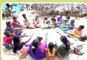
Support to FPOs/ SHGs/ Cooperatives