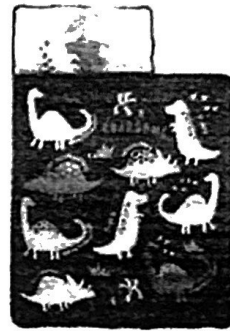
PICTURE OF NAPMAT