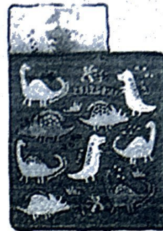
PICTURE OF NAPMAT