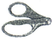
PICTURE OF SCISSORS

***ALL CLASSROOM SUPPLIES ALONG WITH INDIVIDUAL PICTURES, CHANGE OF CLOTHES AND SLEEPING BAG SHOULD BE BROUGHT INTO SCHOOL ON THE NIGHT OF THE PRESCHOOL ORIENTATION.