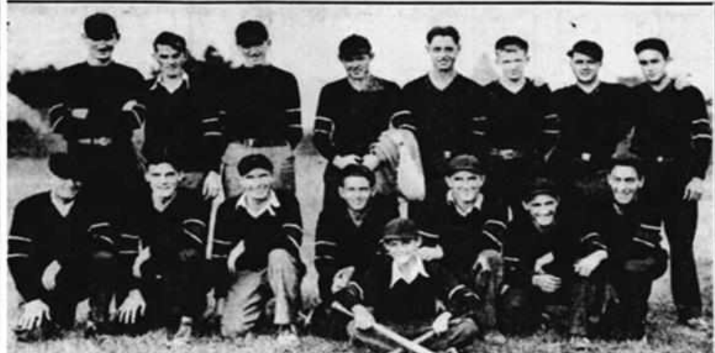
"CHIPPY" PRAYS Grays, who climbed into the title series of the Border Cities intermediate softball playoff against Colley-Jones by swamping General

Reach Intermediate Softball Championship Round