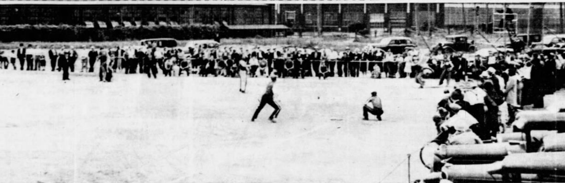
It's competing players, not spectators, who make game popular . . . a typical scene in Industrial League