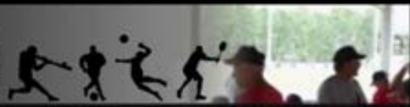
WINDSOR-ESSEX COUNTY SENIOR SPORTS ORGANIZATION

THE BEST SENIOR SPORTS ORGANIZATION IN TOWN Indoor/outdoor slo pitch for men & women