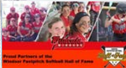
Proud Partners of the Windsor Fastpitch Softball Hall of Fame