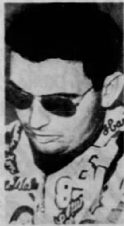
EDDIE (THE KING) FEIGNER ... monarch of softball

Should Feigner get a bit careless and allow the opposition to