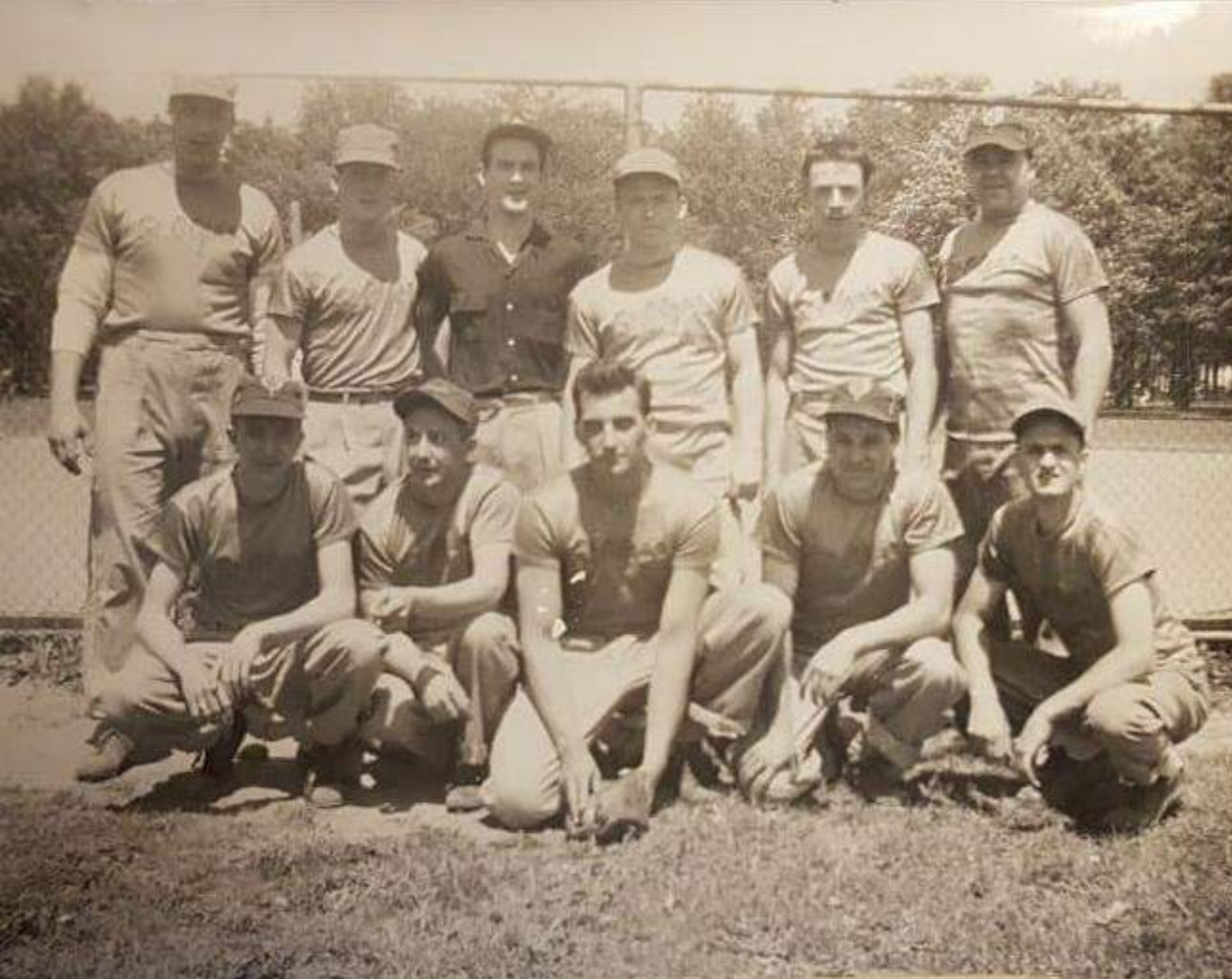
St Olga's Team Picture July 1954