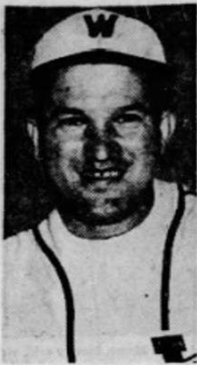
"FLASH" GENGA ★ ★ ★