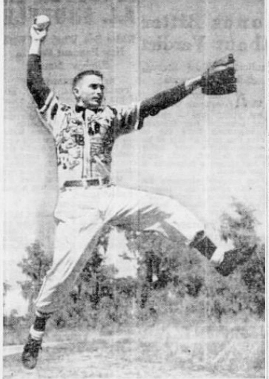
EDDIE FEIGNER - "The King" brings "His Court" to Wigle Park