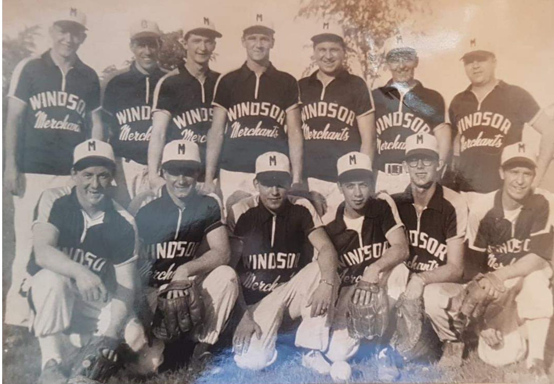
Windsor Merchants Team Picture July 1956