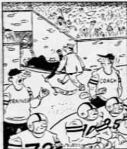
"A loyal, old alumnus Fractured his hip flask."

These are just rumors of the moment, mind you, but they could become a reality in the months ahead. We sincerely hope that the officials running the Recreation League will beware that certain teams don't "load up" to such an extent that some of the other clubs will be shunted right out of business. That's one quick way of breaking up a good softball league.