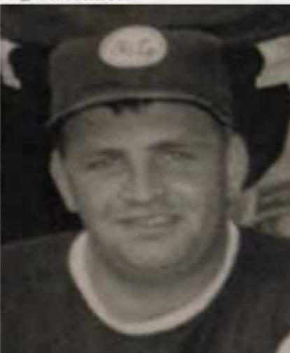
HARVEY BURNS ...HR not enough

Wild P—Lansing 2, Krutsch, PB—Rivalt 2, HP—Krutsch (Lansing), WP—Krutsch, LP—Lansing U—Gumoe, Robinet.