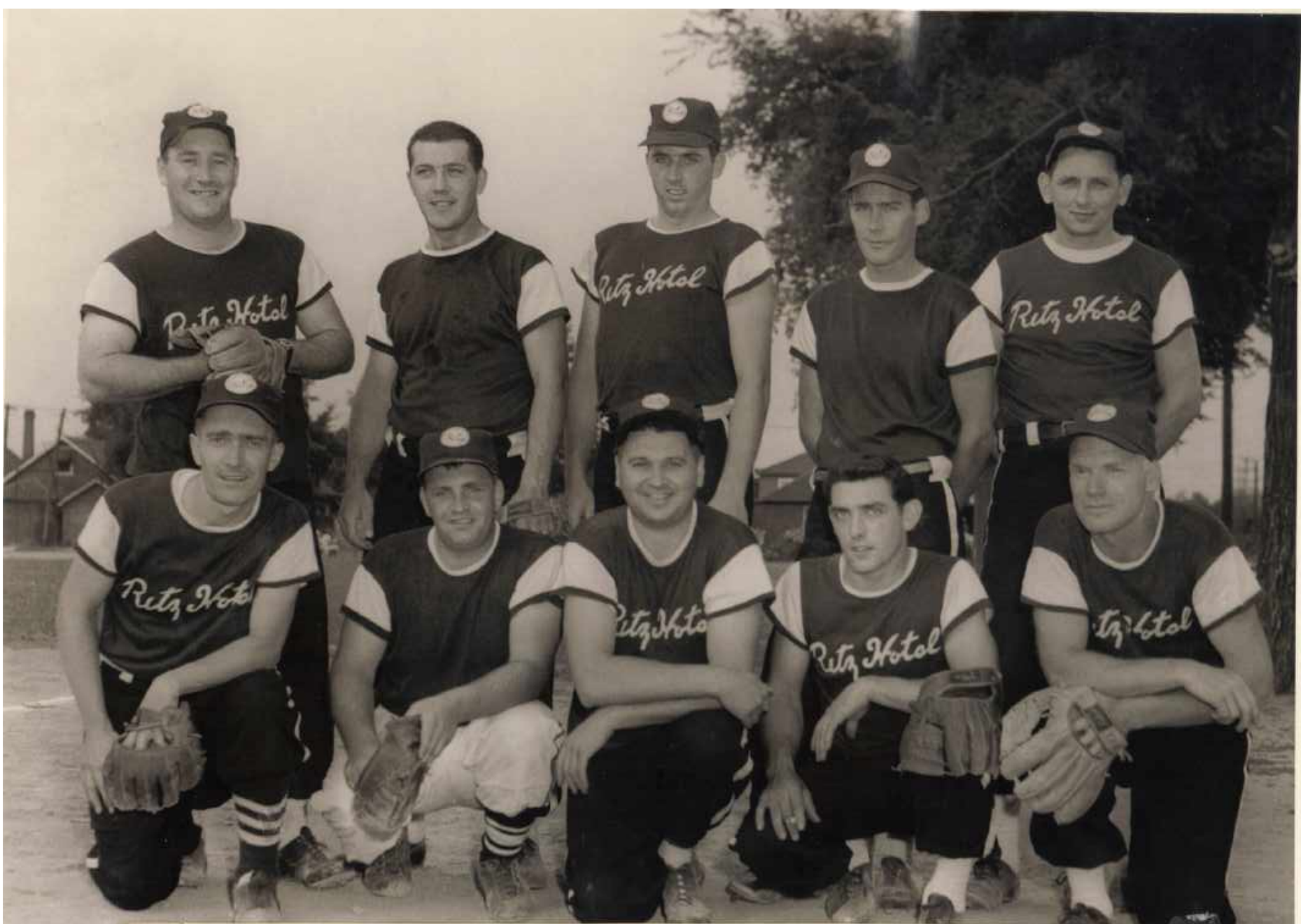
Ritz Hotel Team Picture July 1961