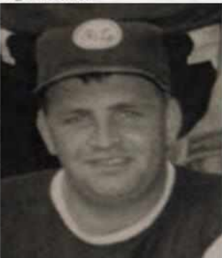
HARVEY BURNS ...HR not enough

Wild P—Lansing 2, Krutsch, PB—Rivalt 2, HP—Krutsch (Lansing), WP—Krutsch, LP—Lansing U—Gumoe, Robinet.