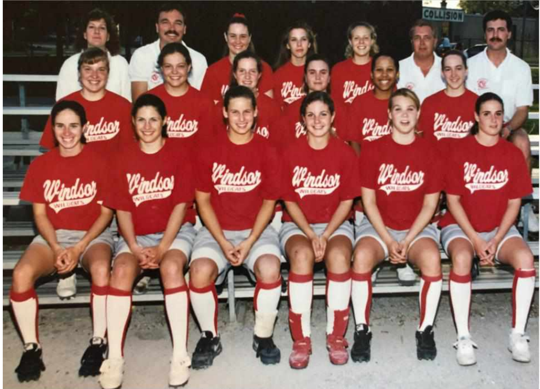
Windsor Wildcats Midget Tier 1 1993