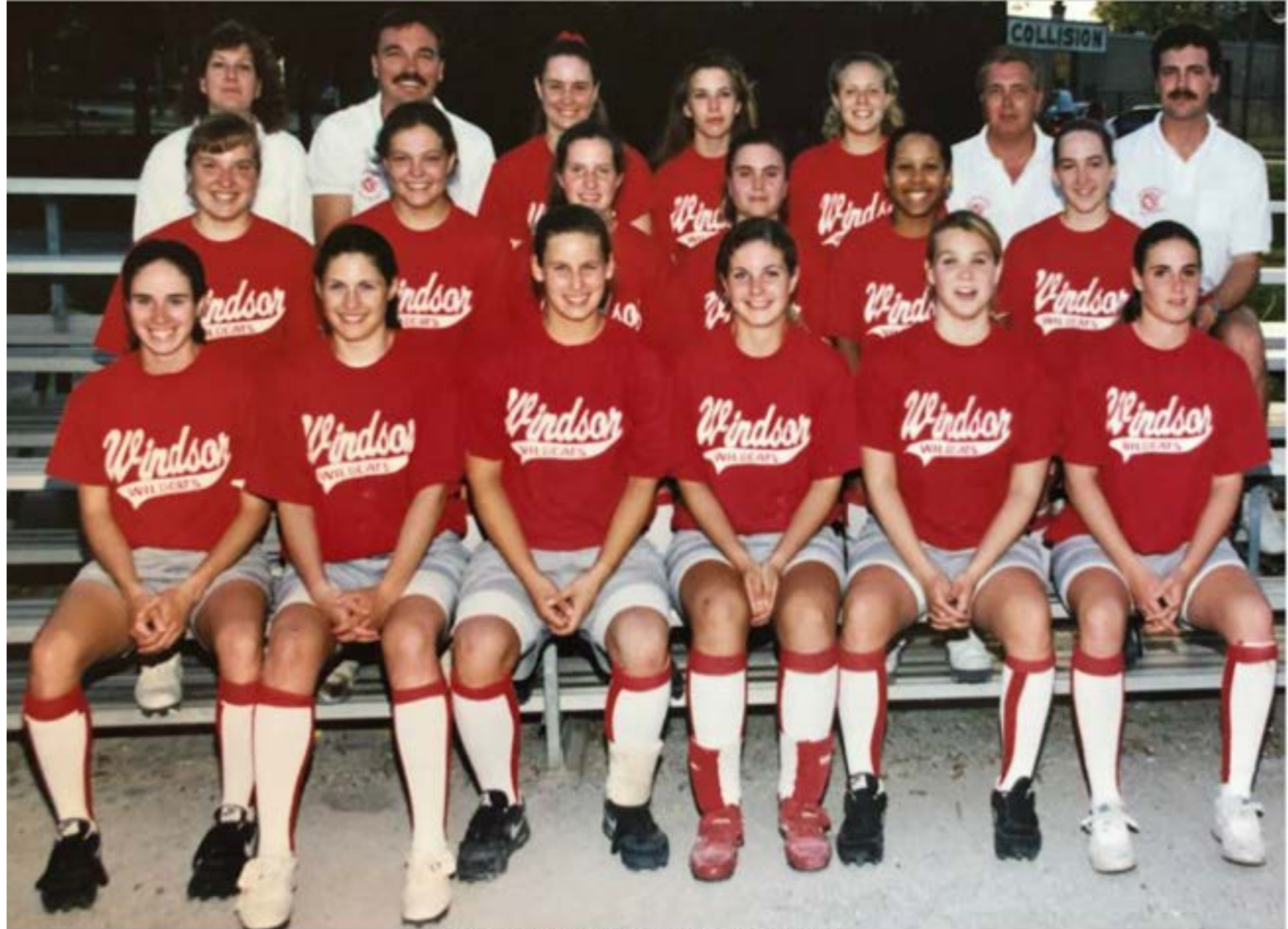
Windsor Wildcats Midget Tier 1 1993