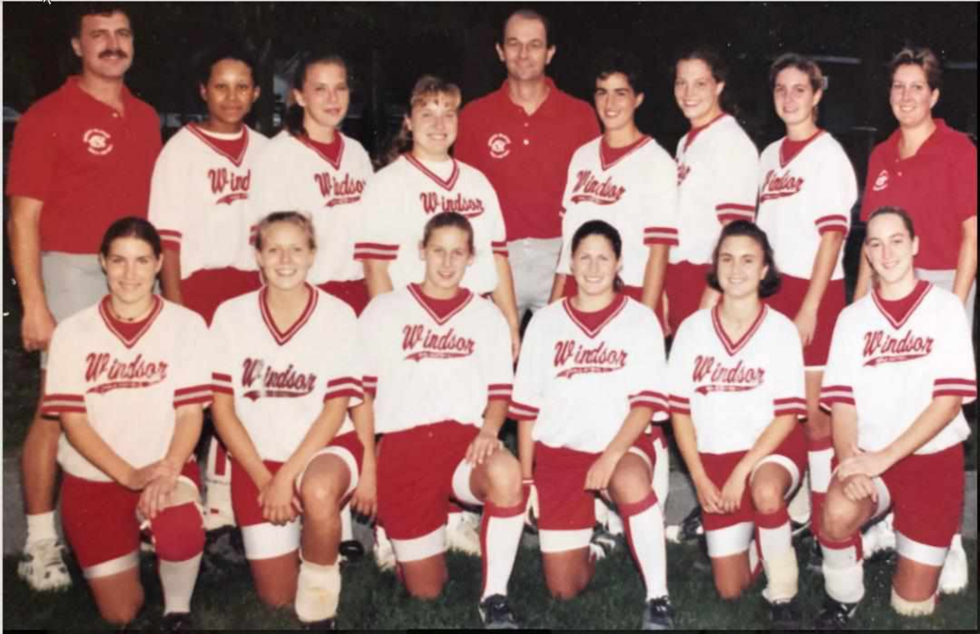
Windsor Wildcats Midget Tier 1 1994