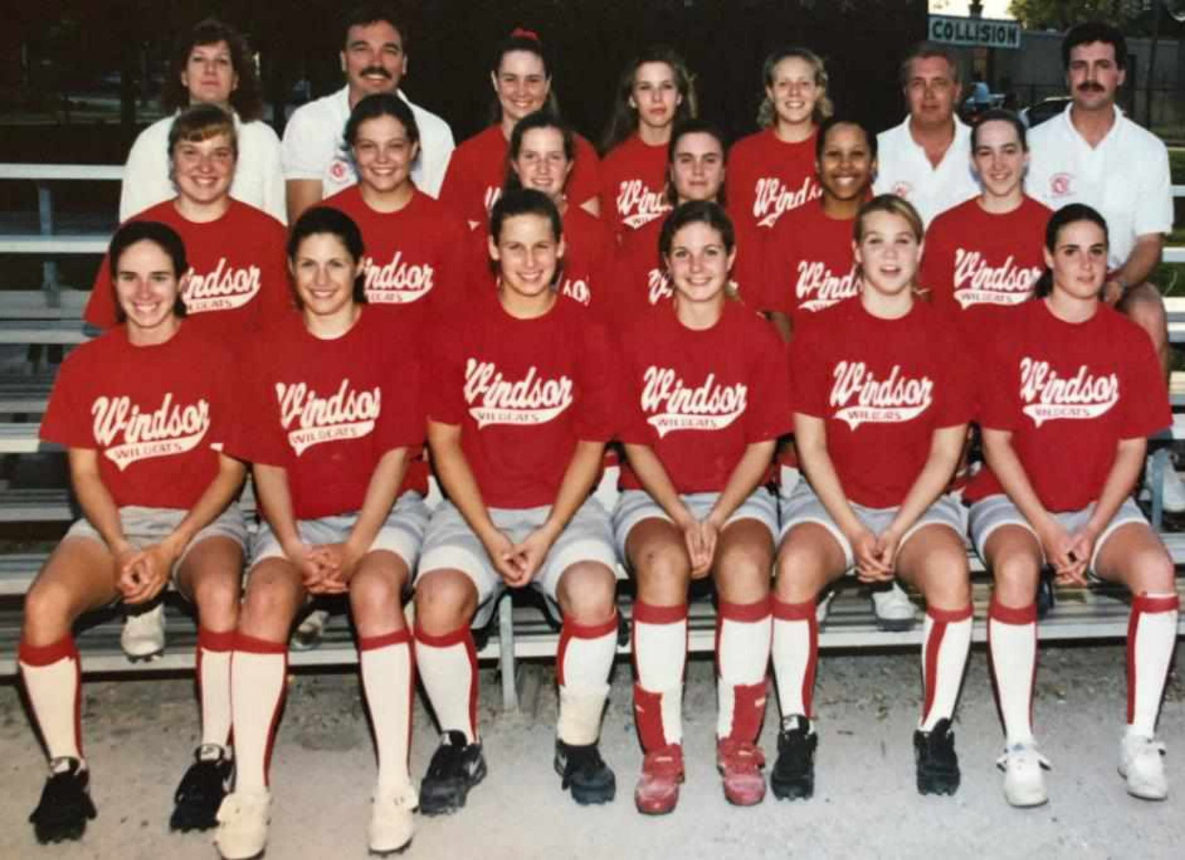
Windsor Wildcats Midget Tier 1 1993