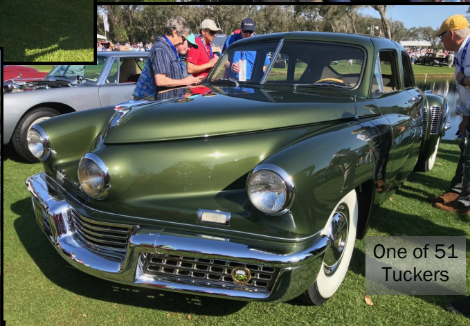
One of 51 Tuckers