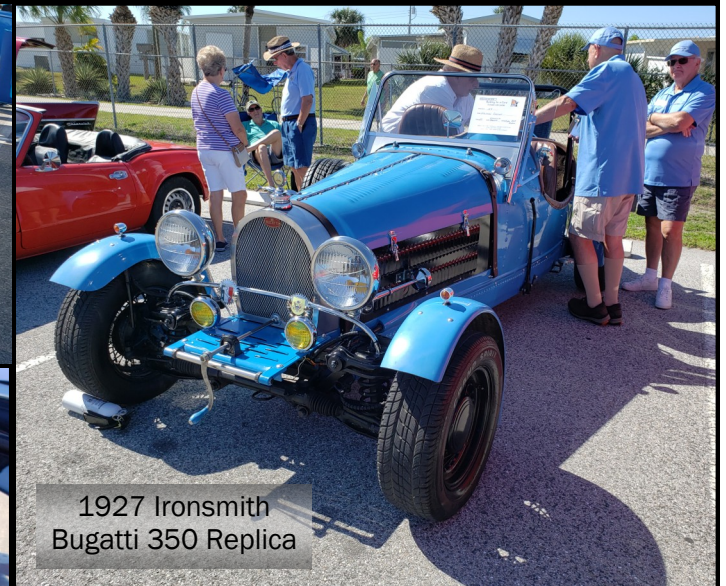
1927 Ironsmith Bugatti 350 Replica