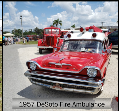
1957 DeSoto Fire Ambulance