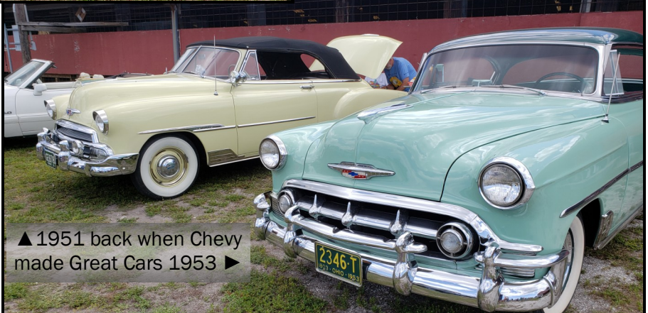
▲ 1951 back when Chevy made Great Cars 1953 ►