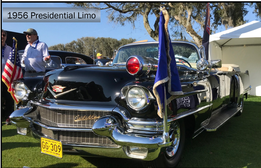
1956 Presidential Limo