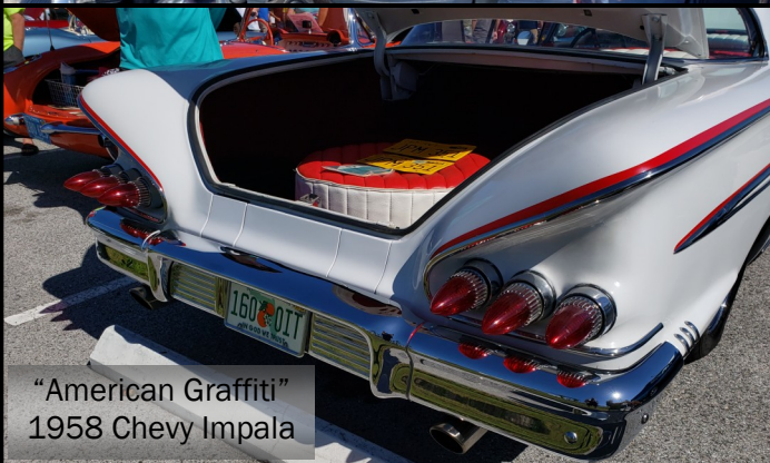
"American Graffiti" 1958 Chevy Impala