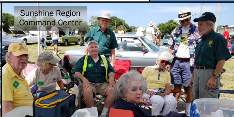
Sunshine Region Command Center