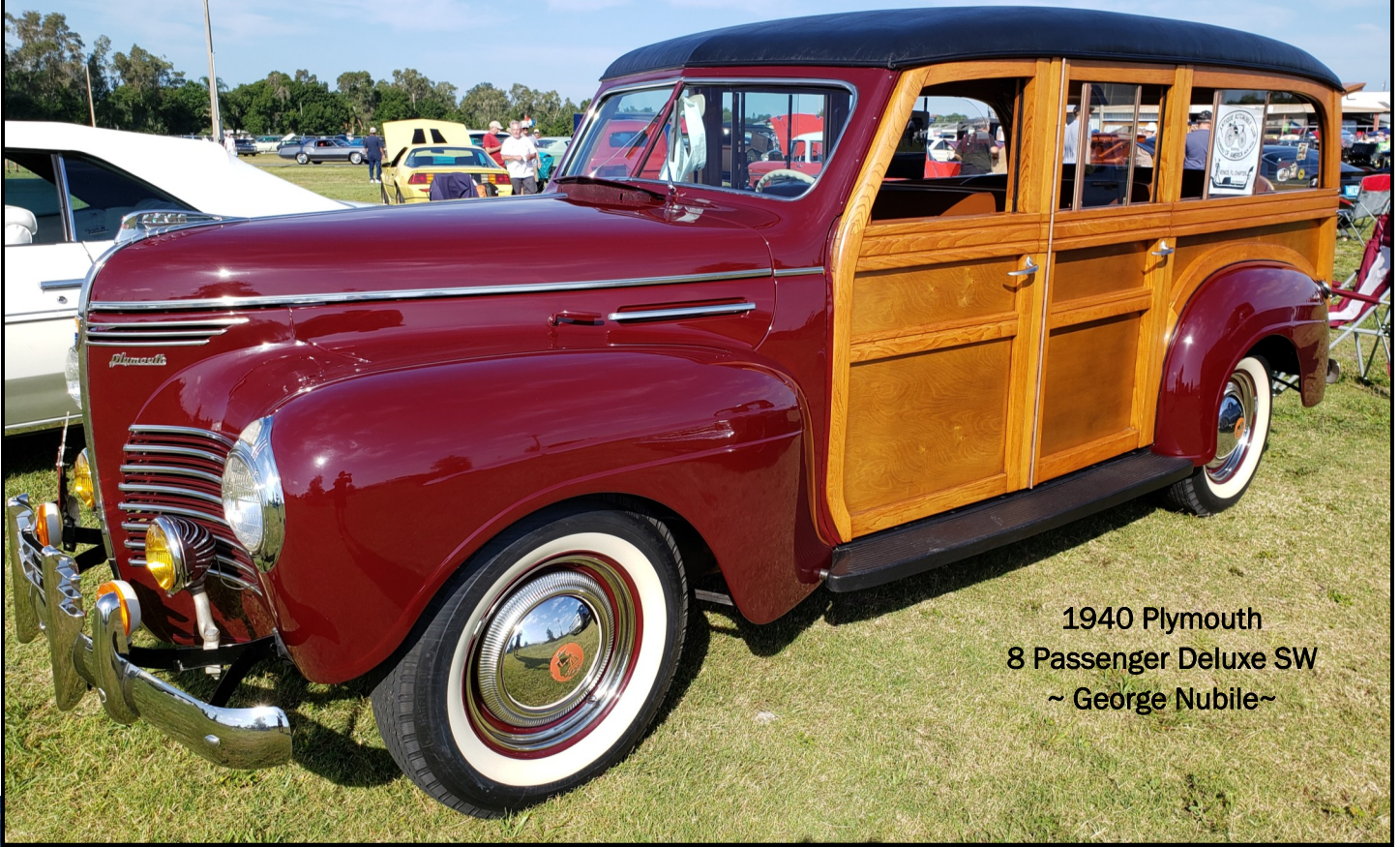
1940 Plymouth 8 Passenger Deluxe SW ~ George Nubile~