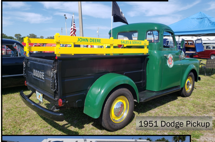
1951 Dodge Pickup