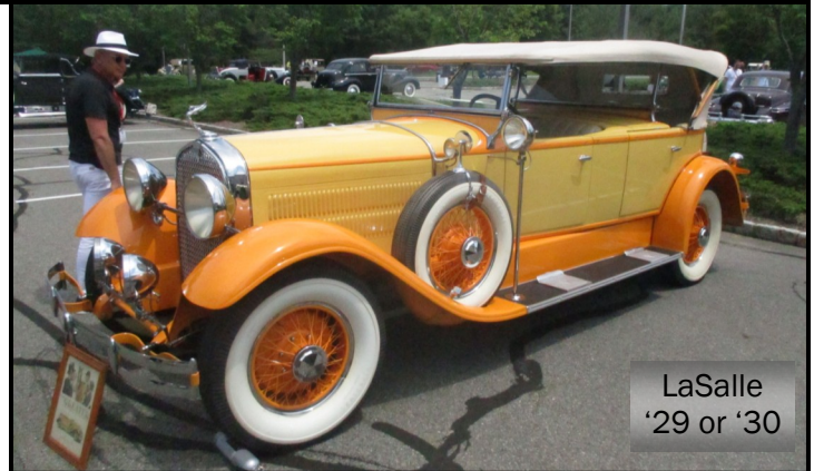
LaSalle '29 or '30