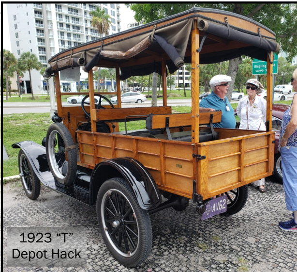
1923 "T" Depot Hack