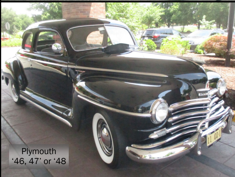
Plymouth '46, '47 or '48