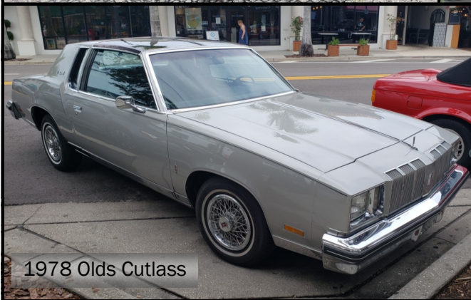
1978 Olds Cutlass