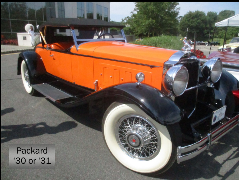
Packard '30 or '31