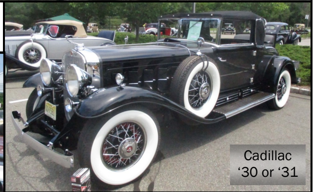
Cadillac '30 or '31