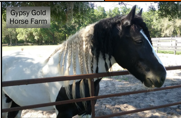
Gypsy Gold Horse Farm

The Gypsy Gold Horse Farm was available for those signing up, and the Appleton Museum of Art was also an option. It was then the return to the inn for the closing banquet and program. A great time was had by all for the 45 vehicles involved and the total miles