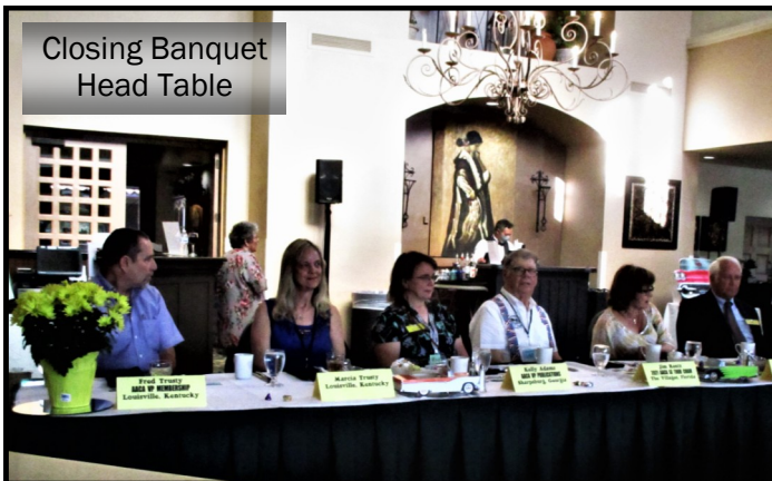
Closing Banquet Head Table