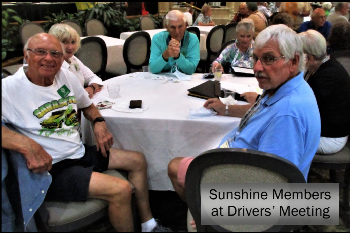
Sunshine Members at Drivers' Meeting

The first major tour of AACA this year was held April 19 thru 22 at the Mission Inn Resort in Howey-in-the-Hills, Florida. Participants arrived on Monday, 4-19 to pick up their tour packets and get checked in at the resort. There was an introductory dessert social and drivers' meeting at the on-site restaurant to receive an overview of the itinerary for the week.