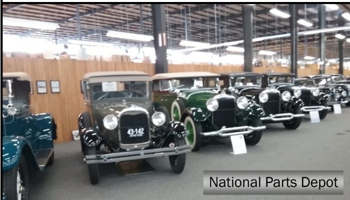
National Parts Depot

abundance. Many of the cars have only from 10 to 100 total miles on them. The 100 millionth and 300 millionth Fords manufactured are included in the collection. A large collection of Kodak products and memorabilia is also housed in the building.