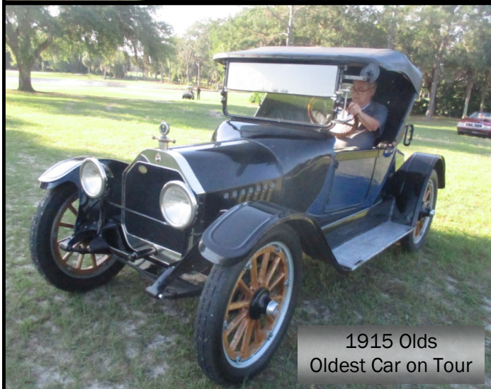
1915 Olds Oldest Car on Tour