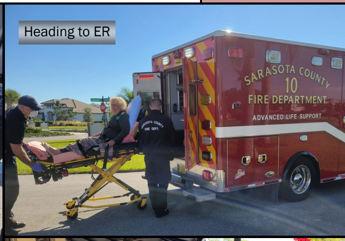
Heading to ER