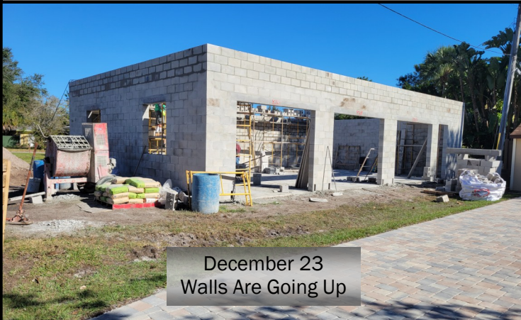
December 23 Walls Are Going Up