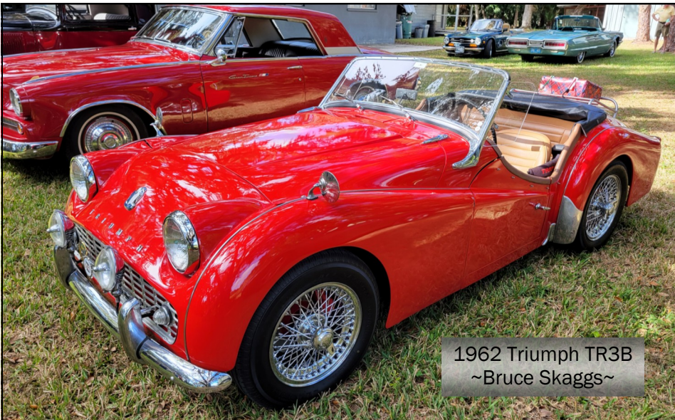
1962 Triumph TR3B ~Bruce Skaggs~

2912 Bee Ridge Rd. Sarasota, FL 34239 SarasotaWowHomes.com