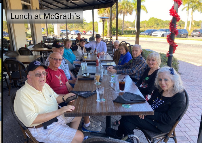
Lunch at McGrath's