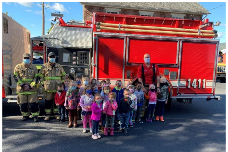
Lynnport Fire Company with Jacob's Church Little Lambs