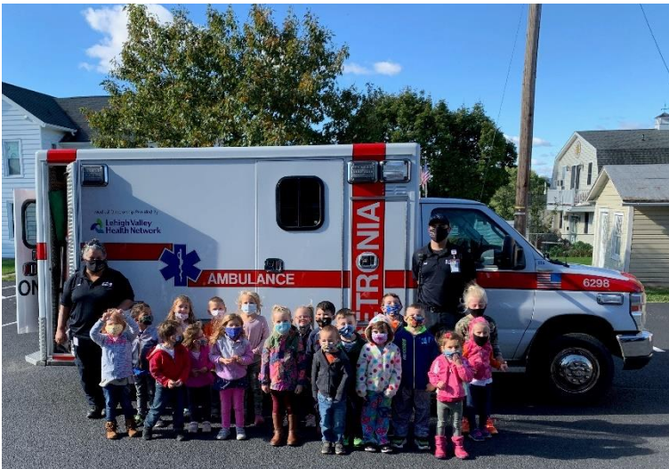
Cetronia Ambulance with Jacob's Church Little Lambs

JACOB'S CHURCH LITTLE LAMBS PRESCHOOL – So many wonderful things happening in our new year at preschool! We are back to a full in person schedule! We have been blessed with amazing weather this fall to enjoy the outdoors together! We have had visitors from Lynnport Fire Company and Cetronia Ambulance Corp. Also, the Honey Bee Princess made a special visit to our preschoolers! We are looking forward to many more wonderful events with our Little Lambs this year.