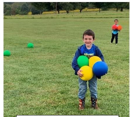
Little Lamb Preschooler