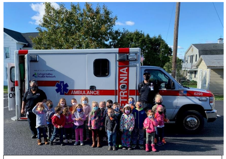
Cetronia Ambulance with Jacob's Church Little Lambs

JACOB'S CHURCH LITTLE LAMBS PRESCHOOL – So many wonderful things happening in our new year at preschool! We are back to a full in person schedule! We have been blessed with amazing weather this fall to enjoy the outdoors together! We have had visitors from Lynnport Fire Company and Cetronia Ambulance Corp. Also, the Honey Bee Princess made a special visit to our preschoolers! We are looking forward to many more wonderful events with our Little Lambs this year.