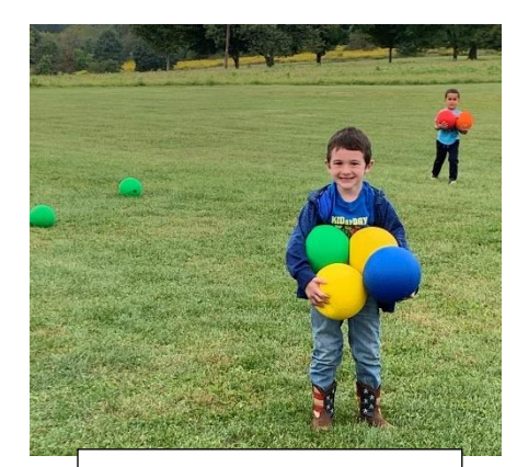
Little Lamb Preschooler