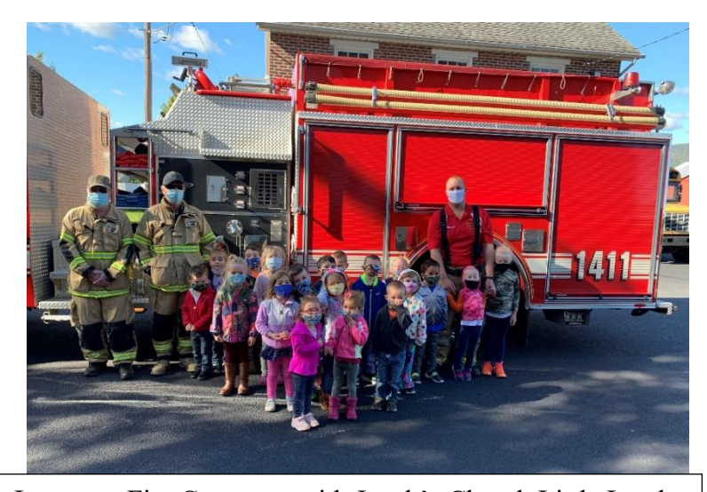
Lynnport Fire Company with Jacob's Church Little Lambs