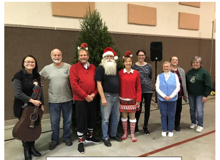
Decorating tree and Choir Fun!