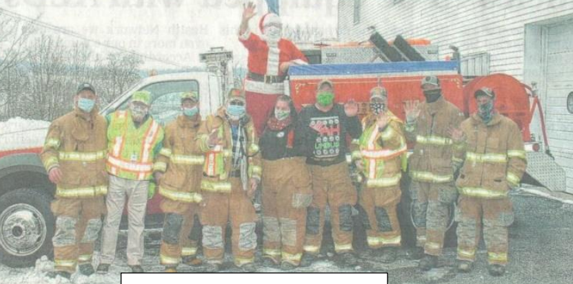
Santa and his masked crew