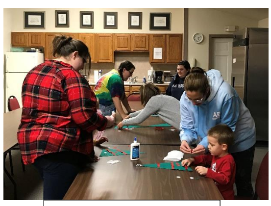
Sidewalk Sunday School