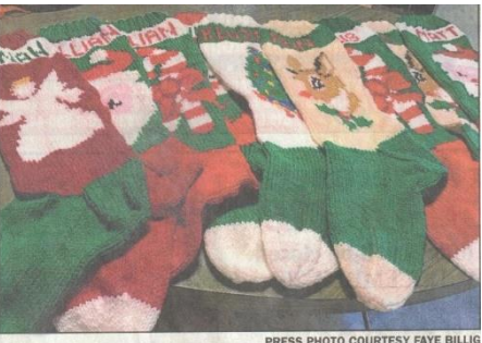
Faye Billig's Christmas stockings capture the warmth of the holidays in design and yarn.