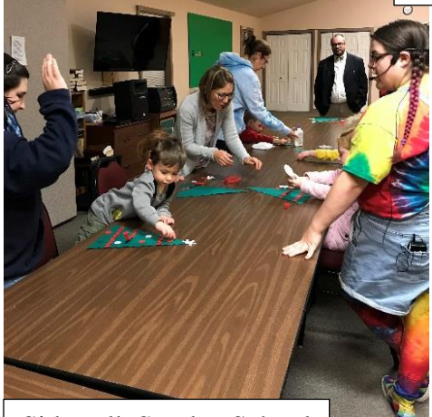
Sidewalk Sunday School