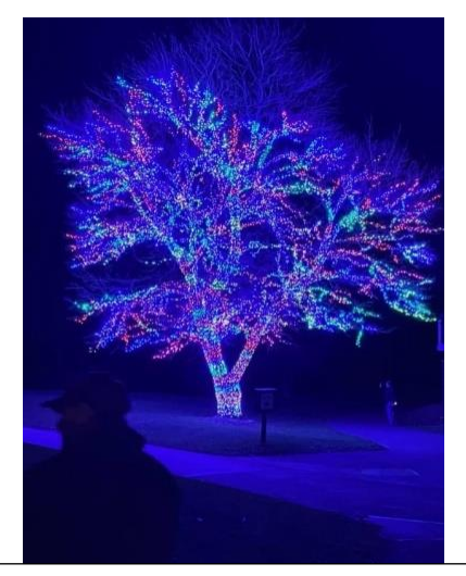
Memorial Tree at local golf course