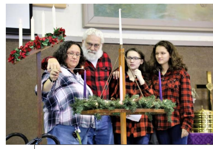
VanBlargan Family lighting advent candle