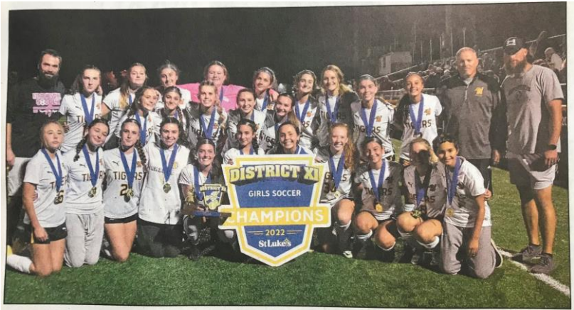
Northwestern knocked off defending state champion Central Catholic in the district championship game.