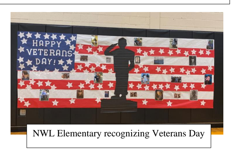
To our men and women in uniform, past, present, and future, God Bless you and Thank you!