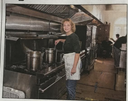
annual oyster dinner Nov. 5 at Jacob's Church, 8373 Kings Highway, New Tripoli.