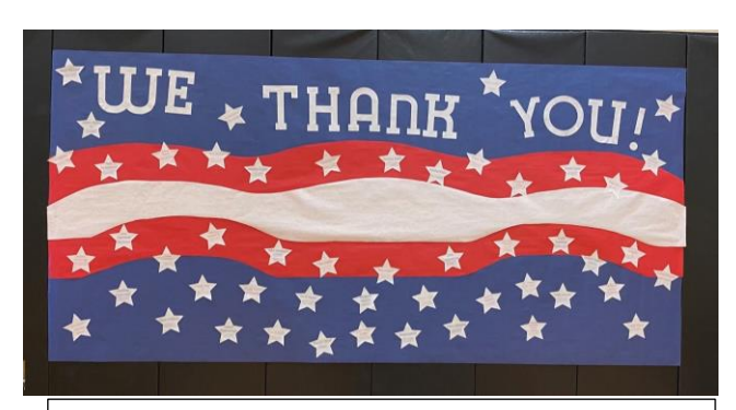
NWL Elementary recognizing Veterans Day