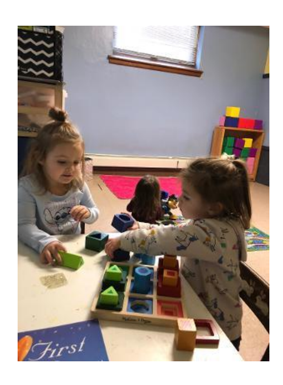
2021-22 Little Lamb Important Date Thursday, February 10th – Valentine's Party