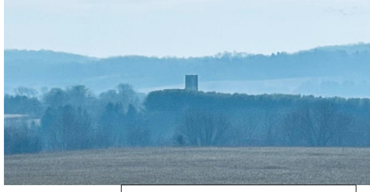
Jacob's Church view from base of Blue mountain on Leaser Road.