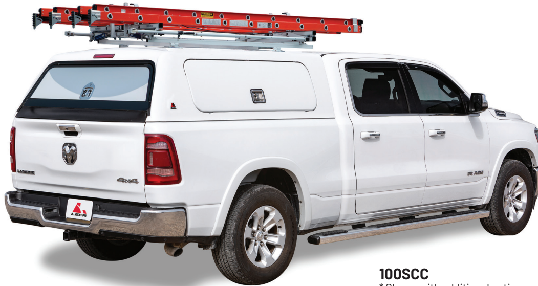
100SCC * Shown with additional options