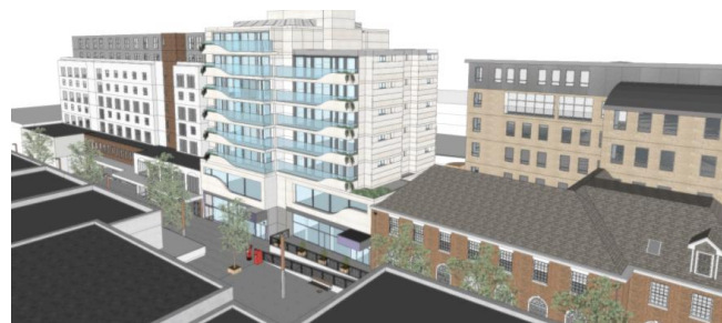
View from High Street looking west.

The Society submitted an objection to the application on the basis that the absence of parking provision does not comply with the council's town centre parking policy that requires 0.9 parking spaces per flat. We are increasingly concerned that town centre developments propose parking provision in existing public car parks. Whilst there is clearly some spare capacity, there should be a clear, publicly consulted plan on the use of public car parks for this purpose. One of the attractions of the Lexicon is the ease of parking that helps attract visitors from a wide area. There is a risk of discouraging visitors if parking becomes a challenge as in other nearby towns.