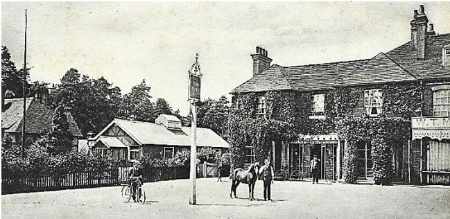
Iron Duke, Crowthorne