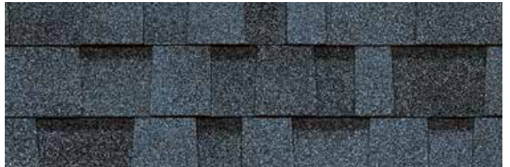
Harbor Blue† Not available in Regions 3 & 4