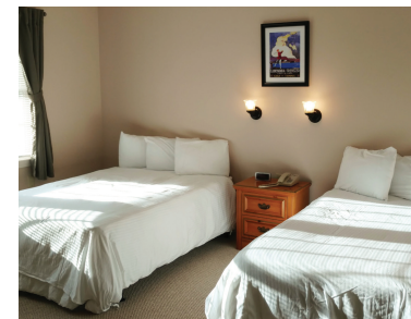
Double occupancy room, Edgewood Building

For reservations, please call Lynn at #802-299-9236 or go online to www.sewonthego.net/retreats or www.lynnwheatley.com/retreats .