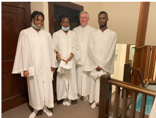
Baptisms - Palm Sunday 10 April