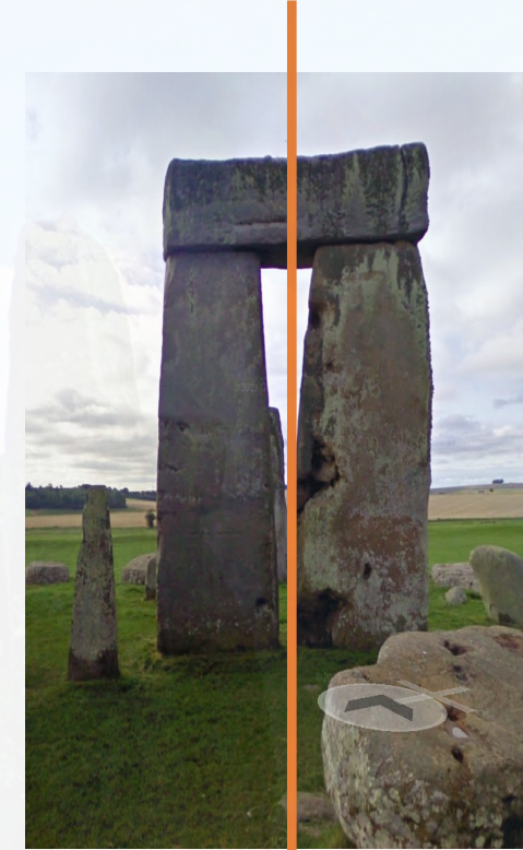
Remains of the structure at stonehenge.