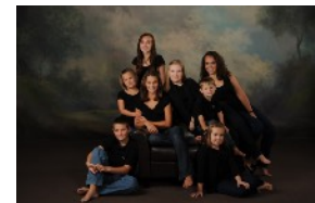
8x10 portrait unit

The 5x7 and wallet sets must be the same pose. Add an extra pose for $20