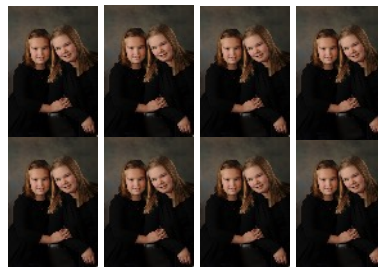
wallet portrait unit

Our custom package are retouched in the facial area only. Special retouching is available. Additional charges apply for special requests